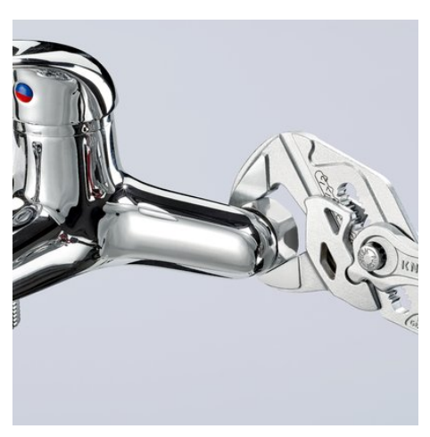
Working on plated fittings without damage of the surface